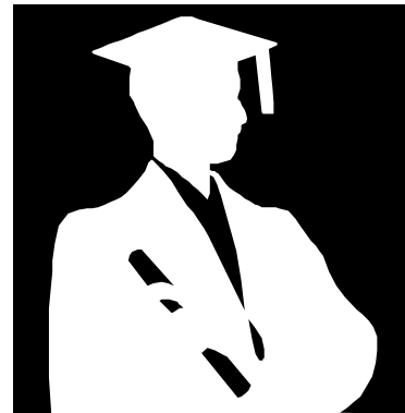
We will be recognizing our High School Graduates on Sunday, June

that other arrangements can be made. There is a sign up sheet available if you would like to help on the organizational committee. Sign up in the lobby.